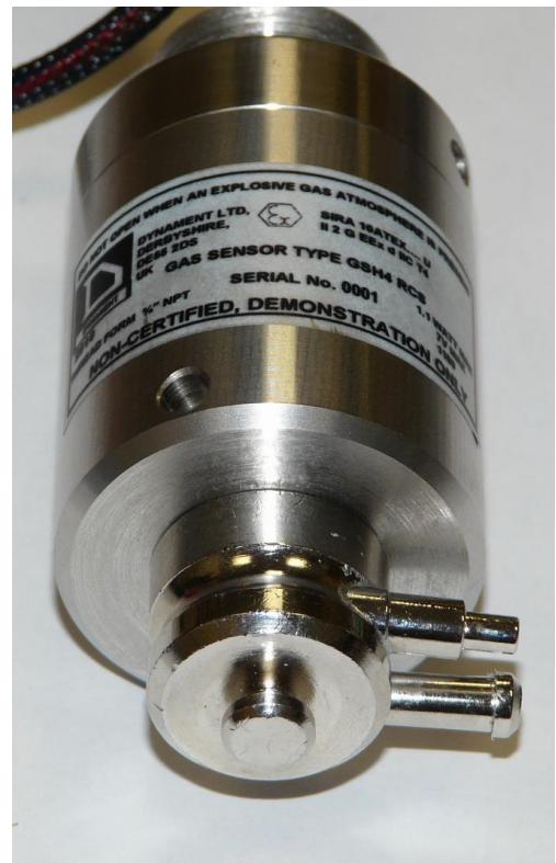
GSH4 fitted with optional Calibration Adaptor Type GSH4 -CAL-ADTR