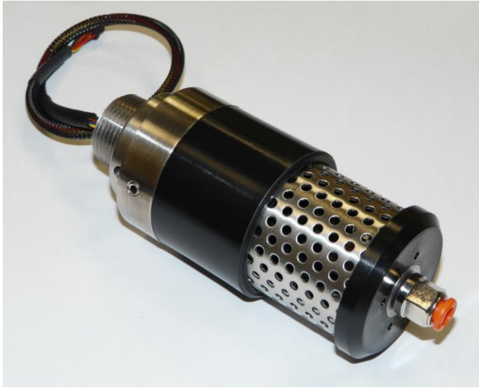
GSH4 fitted with optional Rainguard Type GSH4 - GUARD featuring a gas-sampling tube for gas checks.